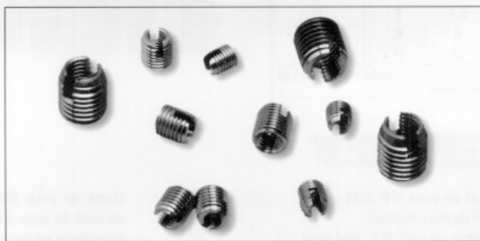
SELF-TAPPING INSERT FOR PLASTICS AND SOFT MATERIALS

61 avenue de l'Europe - 78140 Vélizy-Villacoublay - Tel : 00 33 (0)1 78 74 32 00 - Fax : 00 33 (0)1 78 74 32 01